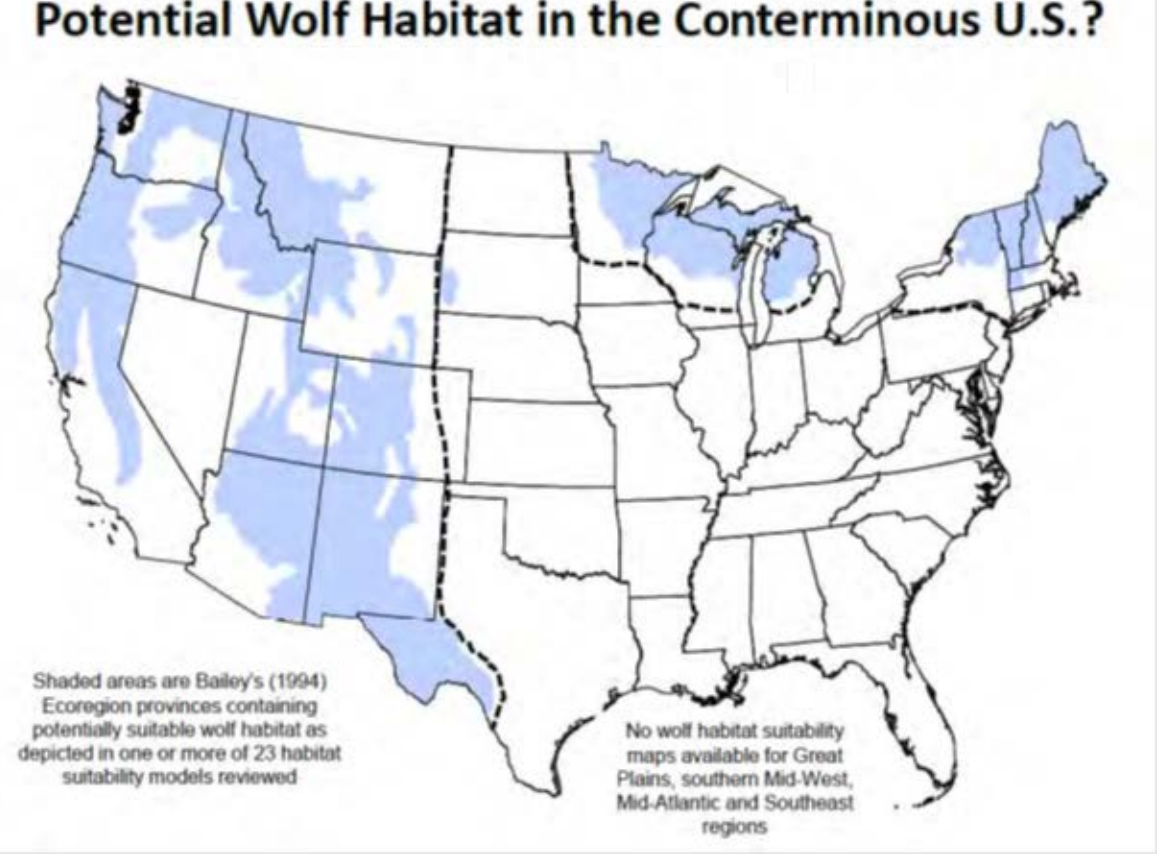
Potential Wolf Habitat in the Conterminous U.S.?

these areas, and thus reach true recovery, by trumpeting progress made toward recovery in the species' current range.